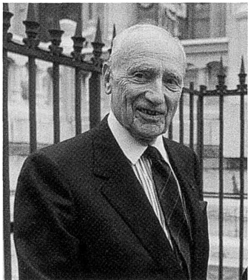
Papon: confronting his accusers in a cold rage